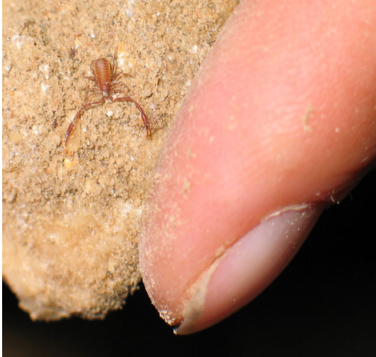
Pseudoscorpion – from a southwest WA cave.

THE 19TH INTERNATIONAL SYMPOSIUM OF SUBTERRANEAN BIOLOGY will convene in Fremantle, Western Australia from 21-26 September 2008 under the auspices of the International Society for Subterranean Biology. These symposia are the principle global forum connecting researchers working on both the terrestrial and aquatic components of subterranean biology.